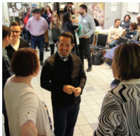
EXHIBIT: 2 PAYCHEQUES AWAY

Kick off your holiday season with a Karaoke Christmas Lights Trolley Tour! Trolley passengers will be whisked away to the sparkling holiday lights at St. Paul's Hospital, Van Dusen Botanical Gardens, and Stanley Park, all while singing along to classic holiday tunes. RSVP at the Learning Exchange or call the front desk at 604-827-2772.